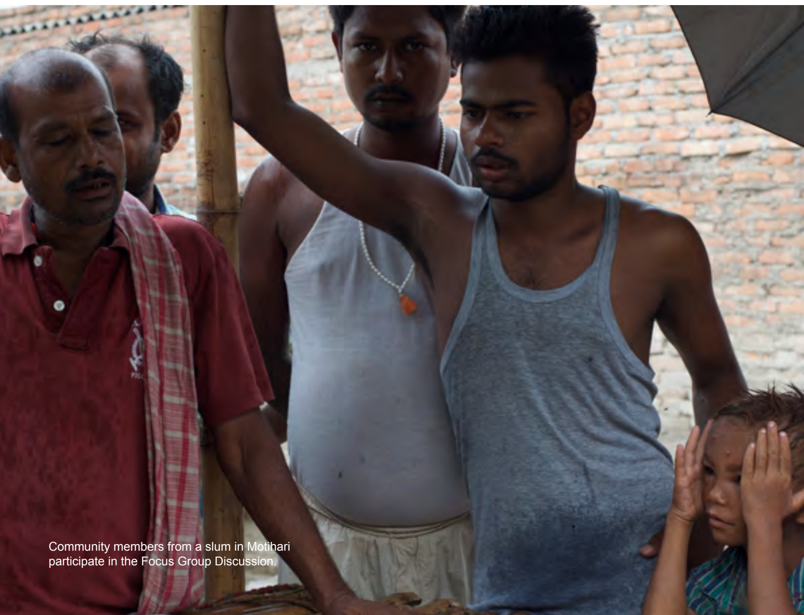
Community members from a slum in Motihari participate in the Focus Group Discussion.