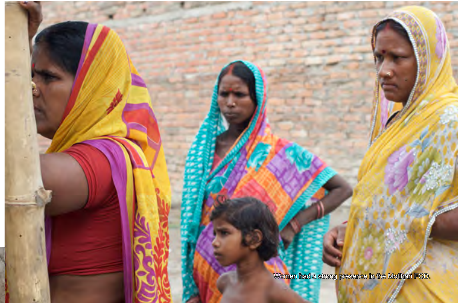
Women had a strong presence in the Motihari FGD.

The following topics were encompassed in this inception report: project's background and context; purpose and scope; work plan including activities to be developed, timeline to be followed, and study tools to be utilized, deliverables; and, finally, limitations and risks of the same. As described in the BSDMA's website, being a state prone to various hazards Bihar requires a multi-disciplinary approach to achieve a successful level of disaster resilience and risk reduction, along with the participation of several stakeholders. The preparation of the DDMPs in Paschim Champaran, Purba Champaran, Sitamarhi, Sheohar, and Muzaffarpur stands for significantly contributing to that.