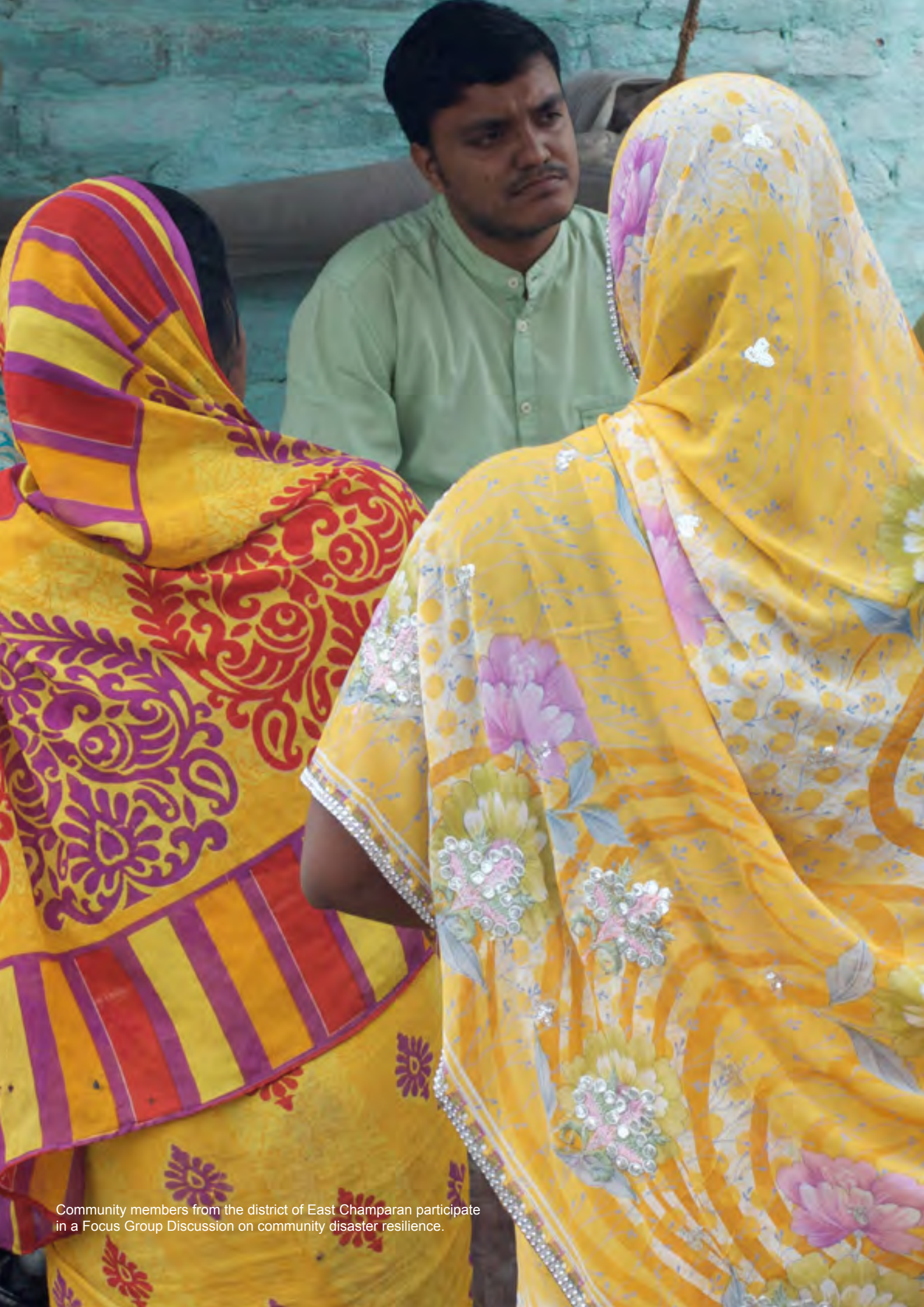
Community members from the district of East Champaran participate in a Focus Group Discussion on community disaster resilience.