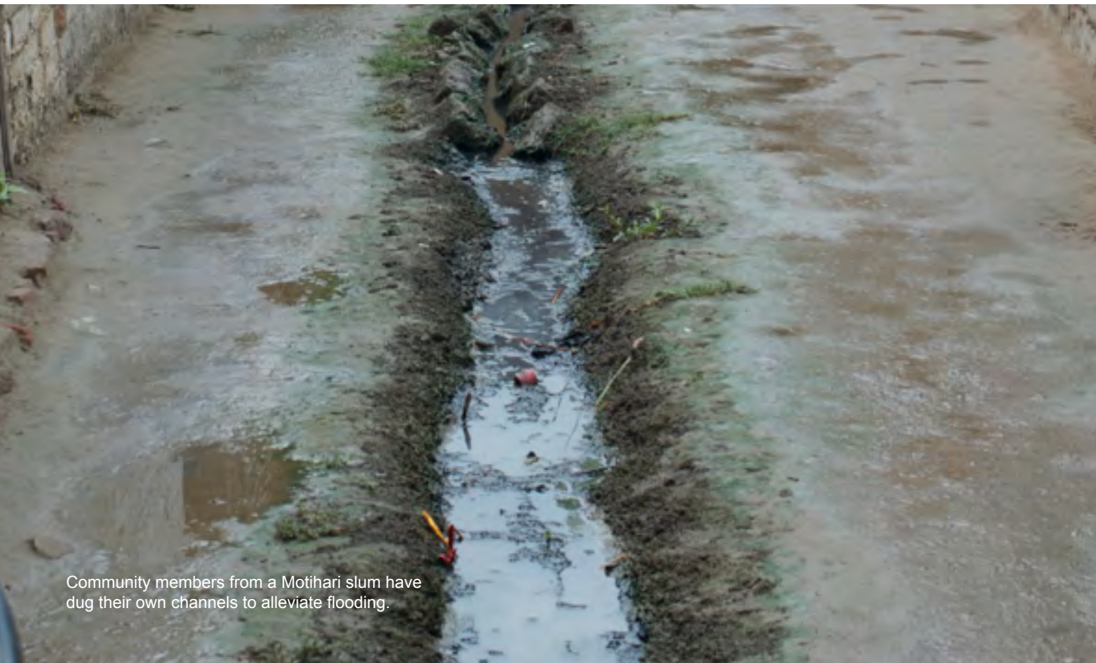
Community members from a Motihari slum have dug their own channels to alleviate flooding.

Apart from that, certain limitations may come into existence without notice. The timeframe for the assignment is feasible to complete the tasks accordingly. However, it is expected appropriate availability and cooperation from the district officials and line department's representatives. While AIDMI is the main responsible to facilitate and conduct the preparation of the DDMPs, districts' engagement is fundamental to a) bring legitimacy to the process and b) empower the agencies to head future plans and activities related to disaster risk reduction. Additionally, the deliverables and respective findings are to be a platform for further action and review by the DDMPs.