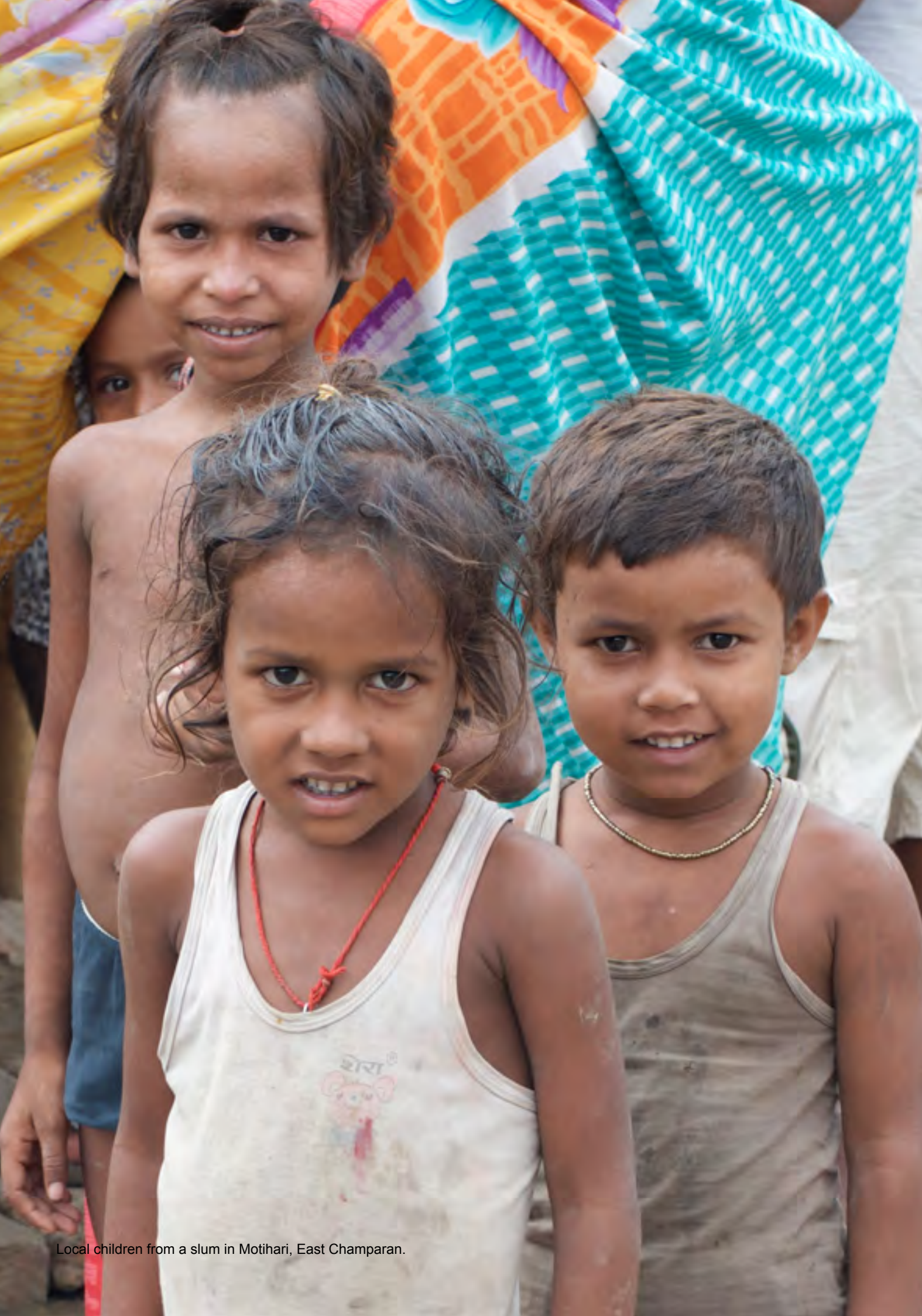
Local children from a slum in Motihari, East Champaran.